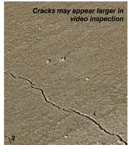
Cracks may appear larger in video inspection

The 0.04-inch crack shown is less than half the crack width of 0.10-inch accepted by Caltrans 4 and AASHTO 5 . Pictures 1, 2, and 3 shown as if viewing the crack standing, kneeling, or through a video inspection, respectively.