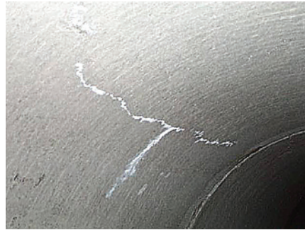
Autogenous healing in concrete pipe.

During this process, calcium carbonate, (a hard white substance), forms when moisture reacts with unhydrated cement powder and regenerates the curing process. This self-healing process creates a monolithic structure. In Ohio, the Department of Transportation developed a post construction inspection standard for installed pipe that requires nothing be done to a pipe with a crack width up to 0.06-inch, due to the autogenous healing that